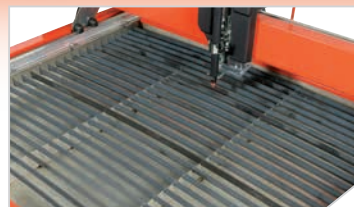
Stainless Steel Water Tray