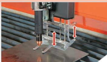
Soft Sense Torch Height Control